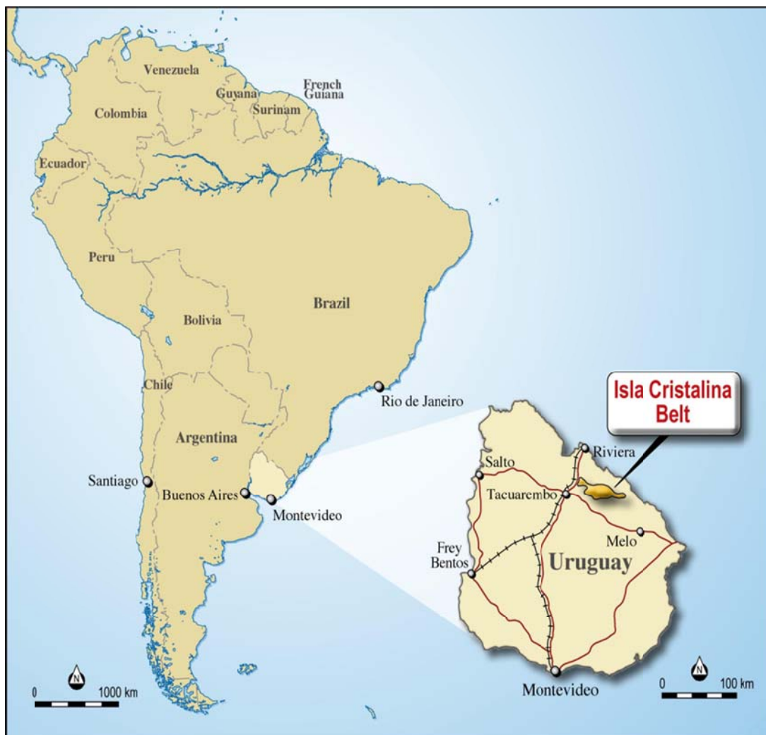
Location of Isla Cristalina Belt in Uruguay